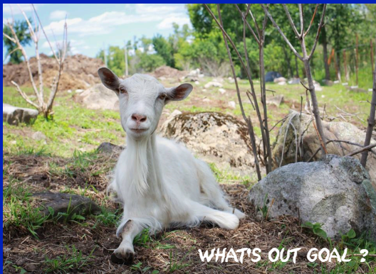
WHAT'S OUR GOAL ?

Wear your colors, bring your banners, show Toronto that your team cares about farm animals