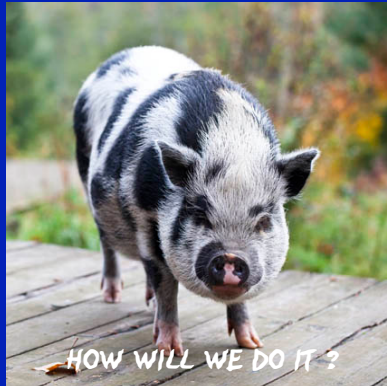
HOW WILL WE DO IT ?