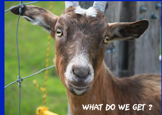
WHAT DO WE GET ?